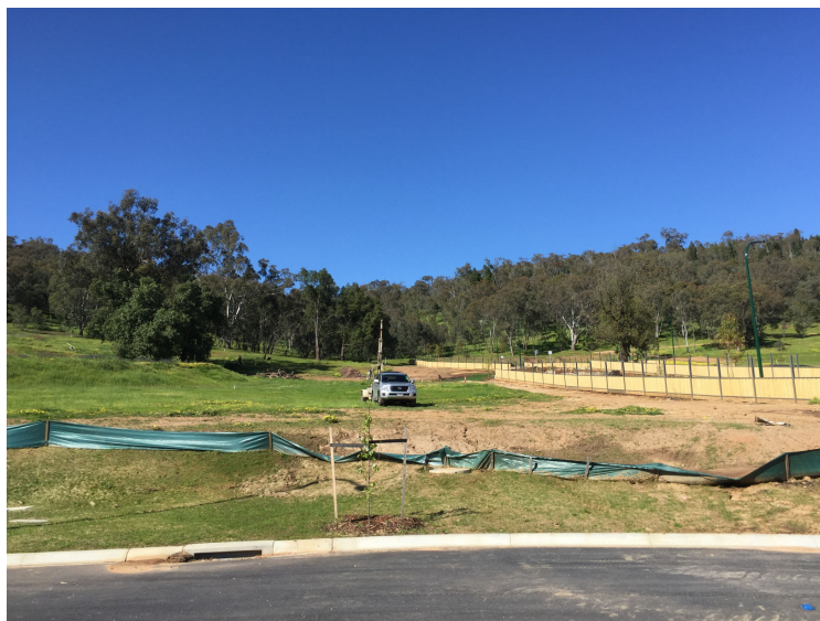
Existing site conditions for proposed dwelling.

1.1 The allotment is part of the "Sienna Ridge Estate" Hamilton Valley, Stages 1 and 2. At the time of the investigation there was a patchy cover of vegetation across the surface and a newly planted tree (approx. 1.5m in height) growing in the front nature strip. Also three newly planted trees (approx. 1.5m to 2.5 high) were located along the adjoining eastern boundary. The area allocated for the house has good fall across the block, sloping towards the front boundary. The land slope of the building footprint is the order of 1 in 15. To provide a level building pad, cut and fill earthworks may have to be undertaken. Site drainage should be further enhanced with landscaping works at the completion of construction.