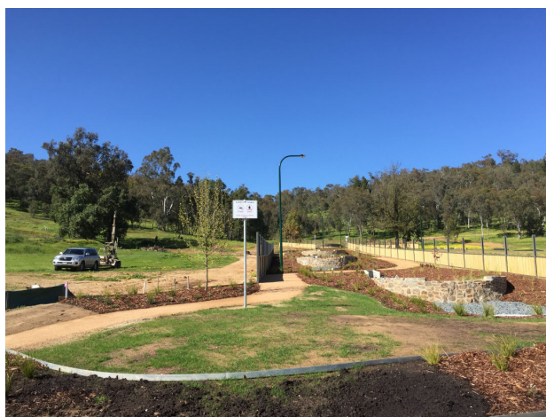
Existing site conditions along eastern boundary.

3.6 The planting of trees close to the building should be avoided. Minimum distance from the building should be at least three quarters of the mature height. Where the building is to be positioned such that trees are planted or any existing trees located at an offset distance that is less than three quarters of the mature height, the design engineer will need to consider additional measures to protect the footing system from trees impacting the stability of the soils within the zone of influence.