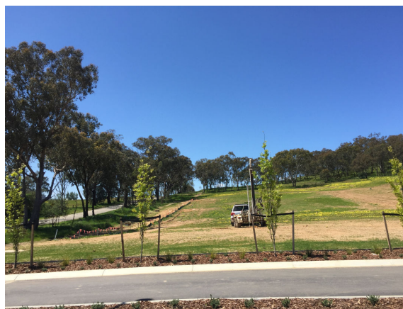
Existing site conditions for proposed dwelling.

1.1 The allotment is part of the “Sienna Ridge Estate” Hamilton Valley, Stages 1 and 2. At the time of the investigation there was a patchy cover of vegetation across the surface and there was five newly planted trees (approx. 2.5m in height) growing in the front nature strip. Also there are a number of native trees (approx. 8m -12m high) were positioned in the road reserve along the northern boundary. The area allocated for the house has good fall across the block, sloping towards the front northwest corner. The land slope of the building footprint is the order of 1 in 20. To provide a level building pad, cut and fill earthworks may have to be undertaken. Site drainage should be further enhanced with landscaping works at the completion of construction.