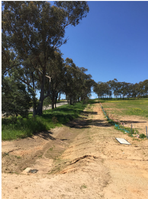
Existing trees along northern boundary.