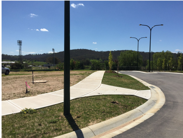
Existing trees along eastern boundary.