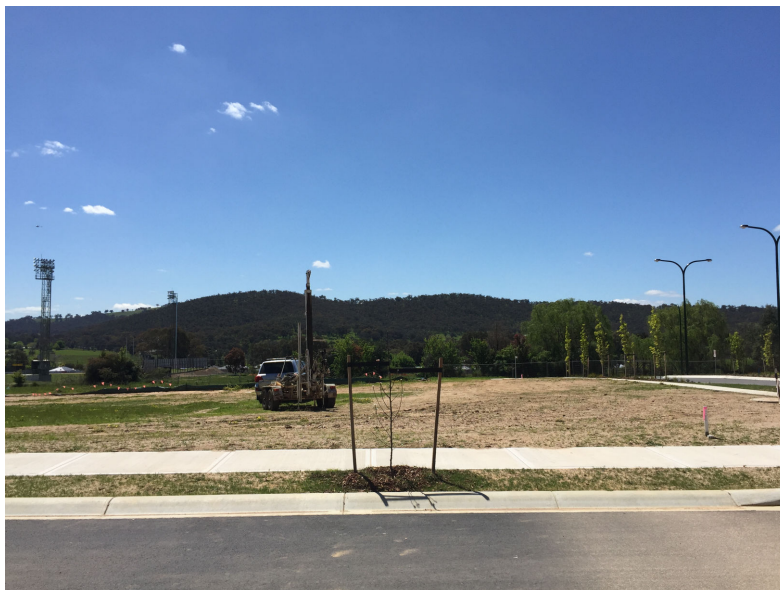
Existing site conditions for proposed dwelling.

1.1 The allotment is part of the "Sienna Ridge Estate" Hamilton Valley, Stages 1 and 2. At the time of the investigation there was a patchy cover of vegetation across the surface and a newly planted tree (approx. 1.0m to 2.5m in height) growing in the front nature strip along the southern and eastern boundary. The area allocated for the house has good fall across the block, sloping towards the rear boundary. The land slope of the building footprint is the order of 1 in 40. To provide a level building pad, cut and fill earthworks may have to be undertaken. Site drainage should be further enhanced with landscaping works at the completion of construction.