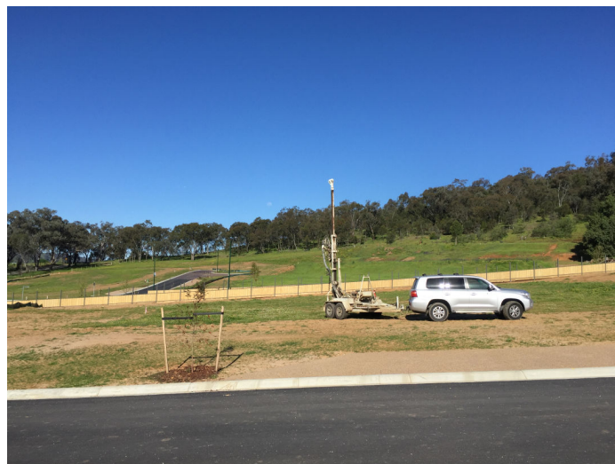
Existing site conditions for proposed dwelling.

1.1 The allotment is part of the "Sienna Ridge Estate" Hamilton Valley, Stages 1 and 2. At the time of the investigation there was a patchy cover of vegetation across the surface and there was a newly planted tree (approx. 1.5m in height) growing in the front nature strip along the western boundary. The area allocated for the house has good fall across the block, sloping towards the northern boundary. The land slope of the building footprint is the order of 1 in 15. To provide a level building pad, cut and fill earthworks may have to be undertaken. Site drainage should be further enhanced with landscaping works at the completion of construction.