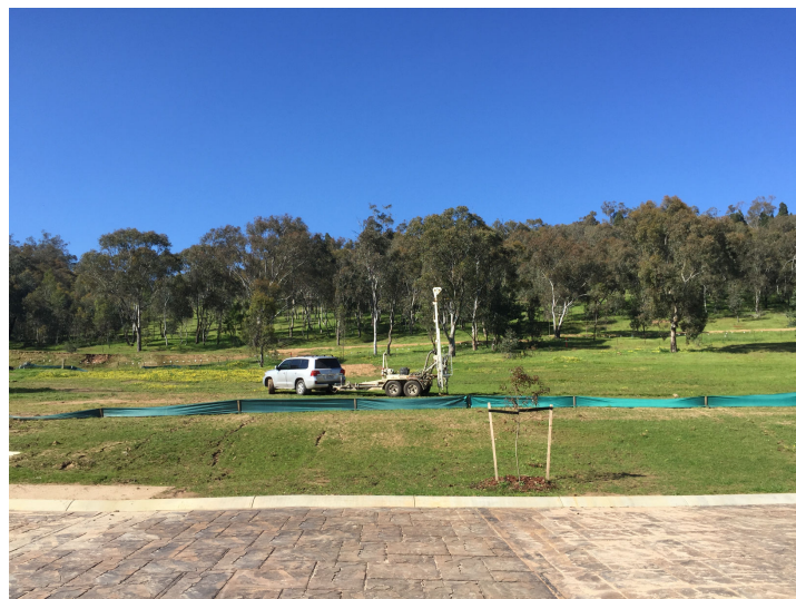
Existing site conditions for proposed dwelling.

1.1 The allotment is part of the "Sienna Ridge Estate" Hamilton Valley, Stages 1 and 2. At the time of the investigation a light cover of vegetation across the surface and there was an 8m high native tree located in the rear southwest corner. Also a newly planted tree (approx. 1.0m in height) growing in the front nature strip. The area allocated for the house has good fall across the block, sloping towards the front northeast corner. The land slope of the building footprint is the order of 1 in 10. To provide a level building pad, cut and fill earthworks may have to be undertaken. Site drainage should be further enhanced with landscaping works at the completion of construction.