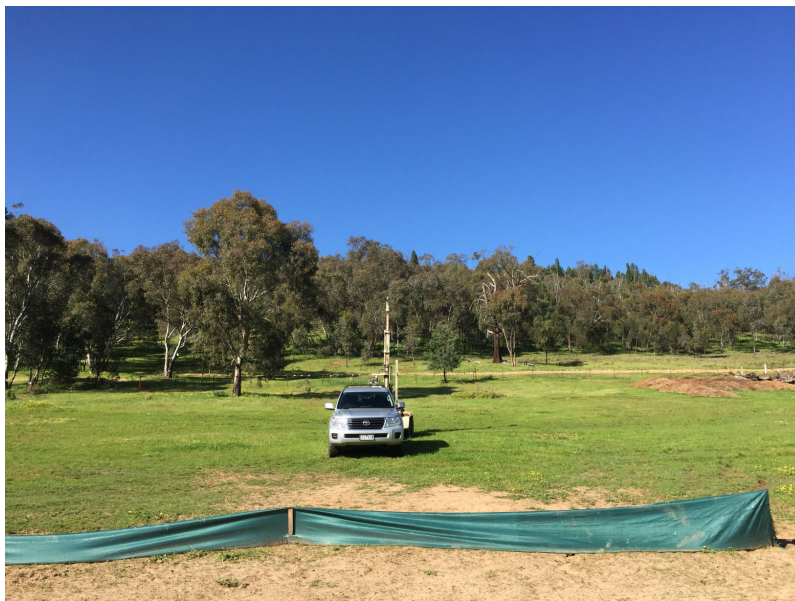
Existing site conditions for proposed dwelling.

1.1 The allotment is part of the "Sienna Ridge Estate" Hamilton Valley, Stages 1 and 2. At the time of the investigation a light cover of vegetation across the surface and there was an 8m high native tree growing in the rear southeast corner. The area allocated for the house has good fall across the block, sloping towards the front northeast corner. The land slope of the building footprint is the order of 1 in 8. To provide a level building pad, cut and fill earthworks may have to be undertaken. Site drainage should be further enhanced with landscaping works at the completion of construction.