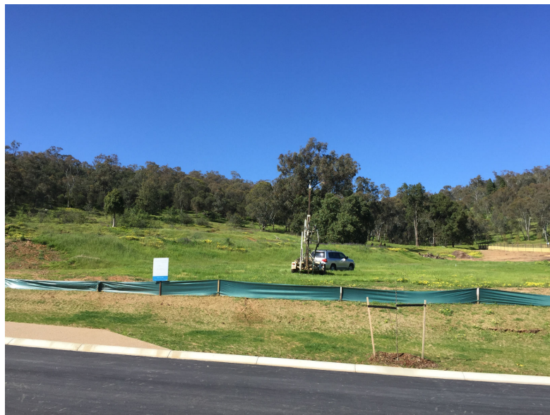
Existing site conditions for proposed dwelling.

1.1 The allotment is part of the "Sienna Ridge Estate" Hamilton Valley, Stages 1 and 2. At the time of the investigation there was a light cover of vegetation across the surface and two newly planted trees (approx. 1.0m in height) growing in the front nature strip. The area allocated for the house has good fall across the block, sloping towards the front boundary. The land slope of the building footprint is the order of 1 in 10. To provide a level building pad, cut and fill earthworks may have to be undertaken. Site drainage should be further enhanced with landscaping works at the completion of construction.