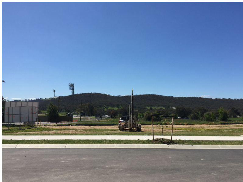
Existing site conditions for proposed dwelling.

1.1 The allotment is part of the "Sienna Ridge Estate" Hamilton Valley, Stages 1 and 2. At the time of the investigation there was a patchy cover of vegetation across the surface and a newly planted tree (approx. 1.0m in height) growing in the front nature strip. The area allocated for the house has good fall across the block, sloping towards the rear boundary. The land slope of the building footprint is the order of 1 in 40. To provide a level building pad, cut and fill earthworks may have to be undertaken. Site drainage should be further enhanced with landscaping works at the completion of construction.