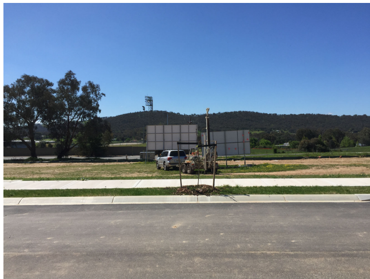
Existing site conditions for proposed dwelling.

1.1 The allotment is part of the "Sienna Ridge Estate" Hamilton Valley, Stages 1 and 2. At the time of the investigation there was a patchy cover of vegetation across the surface and a newly planted tree (approx. 1.0m in height) growing in the front nature strip. The area allocated for the house has good fall across the block, sloping towards the rear boundary. The land slope of the building footprint is the order of 1 in 40. To provide a level building pad, cut and fill earthworks may have to be undertaken. Site drainage should be further enhanced with landscaping works at the completion of construction.