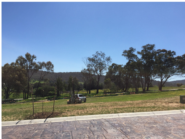
Existing site conditions for proposed dwelling.

1.1 The allotment is part of the "Sienna Ridge Estate" Hamilton Valley, Stages 1 and 2. At the time of the investigation there was a patchy cover of vegetation across the surface and a newly planted tree (approx. 1.0m in height) growing in the front nature strip. Also there are a number of native trees (approx. 8m -12m high) were positioned in the road reserve along the rear northern boundary. The area allocated for the house has good fall across the block, sloping towards the rear northwest corner. The land slope of the building footprint is the order of 1 in 8. To provide a level building pad, cut and fill earthworks will have to be undertaken. Site drainage should be further enhanced with landscaping works at the completion of construction.