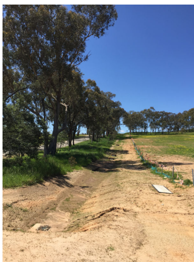
Existing trees along rear northern boundary.

3.6 The planting of trees close to the building should be avoided. Minimum distance from the building should be at least three quarters of the mature height. Where the building is to be positioned such that trees are planted or any existing trees located at an offset distance that is less than three quarters of the mature height, the design engineer will need to consider additional measures to protect the footing system from trees impacting the stability of the soils within the zone of influence.