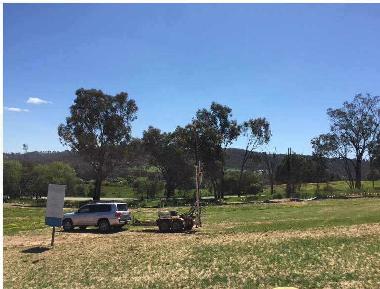
Existing site conditions for proposed dwelling.

1.1 The allotment is part of the "Sienna Ridge Estate" Hamilton Valley, Stages 1 and 2. At the time of the investigation there was a patchy cover of vegetation across the surface and there are a number of native trees (approx. 8m -12m high) were positioned in the road reserve along the rear northern boundary. The area allocated for the house has good fall across the block, sloping towards the rear northwest corner. The land slope of the building footprint is the order of 1 in 10. To provide a level building pad, cut and fill earthworks will have to be undertaken. Site drainage should be further enhanced with landscaping works at the completion of construction.